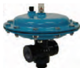
CVS 128PQ Control Valve