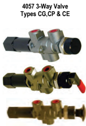
4057 3-Way Valve Types CG, CP & CE