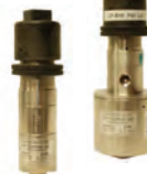
7970 Pressure Pilots