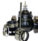
CVS E Body & Trim