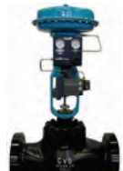
CVS EW Valve Body