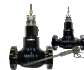
CVS Series D Body & Trim