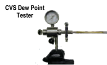
CVS Dew Point Tester