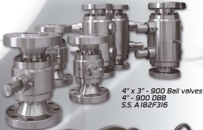
4" x 3" - 900 Ball valves 4" - 900 DBB S.S. A182F316