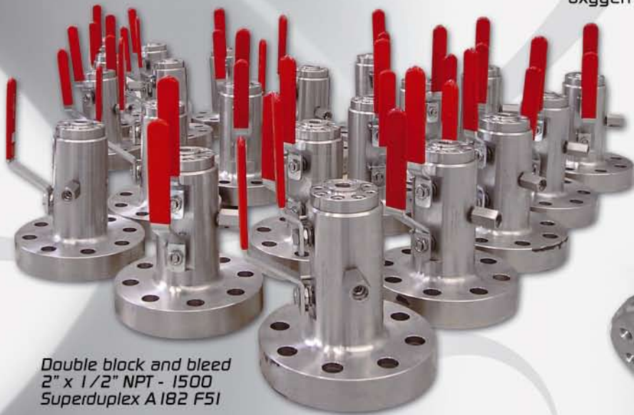
Double block and bleed 2" x 1/2" NPT - 1500 Superduplex A 182 F51