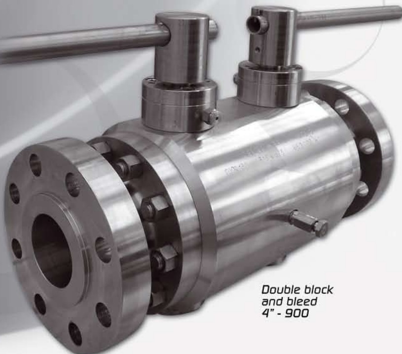
Double block and bleed 4" - 900