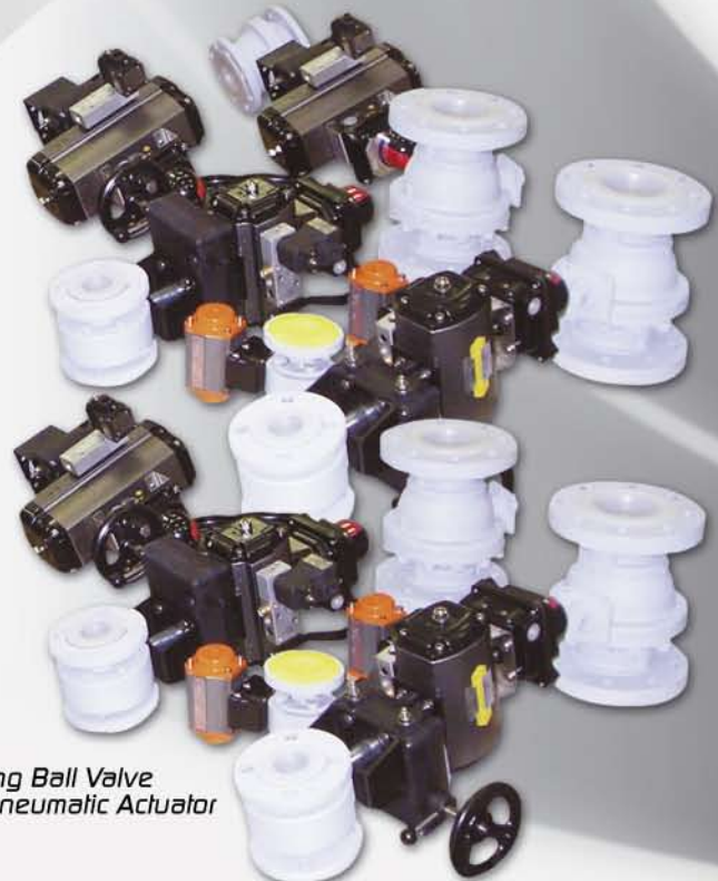
Floating Ball Valve with Pneumatic Actuator