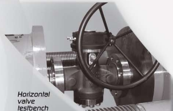
Horizontal valve testbench