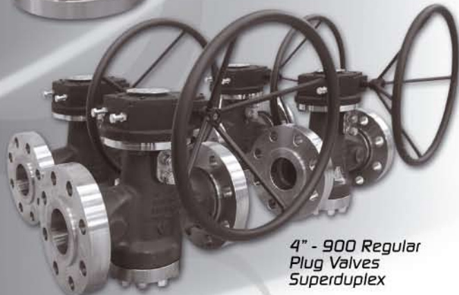
4" - 900 Regular Plug Valves Superduplex

· Ball valve double block&bleed: class 150-300-600-900-1500 size 1/2" - 8"