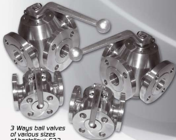
3 Ways ball valves of various sizes of hastelloy® C22