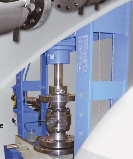
Vertical valve testbenches size 2"-24"