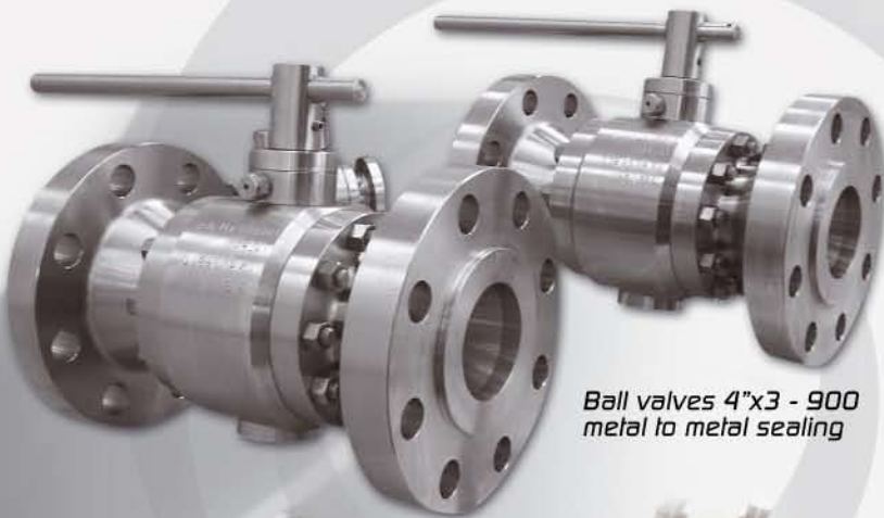
Ball valves 4"x3 - 900 metal to metal sealing