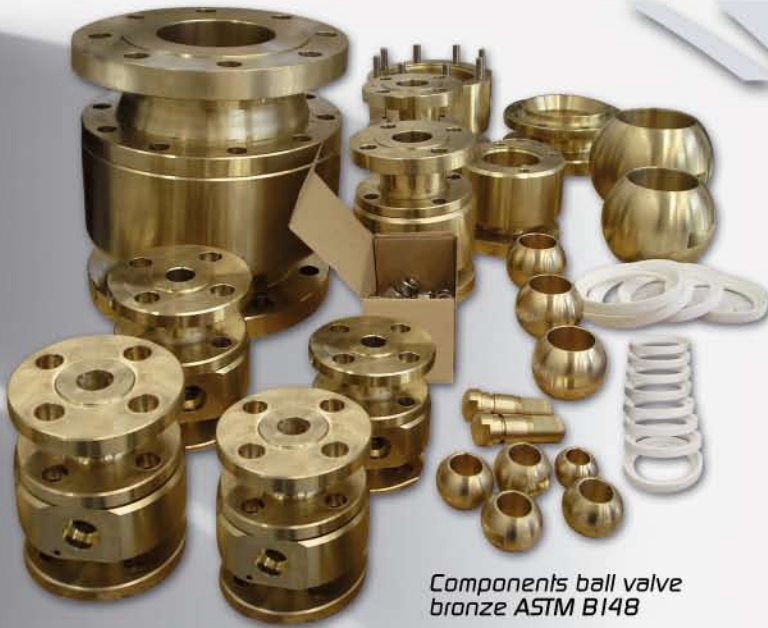
Components ball valve bronze ASTM B148