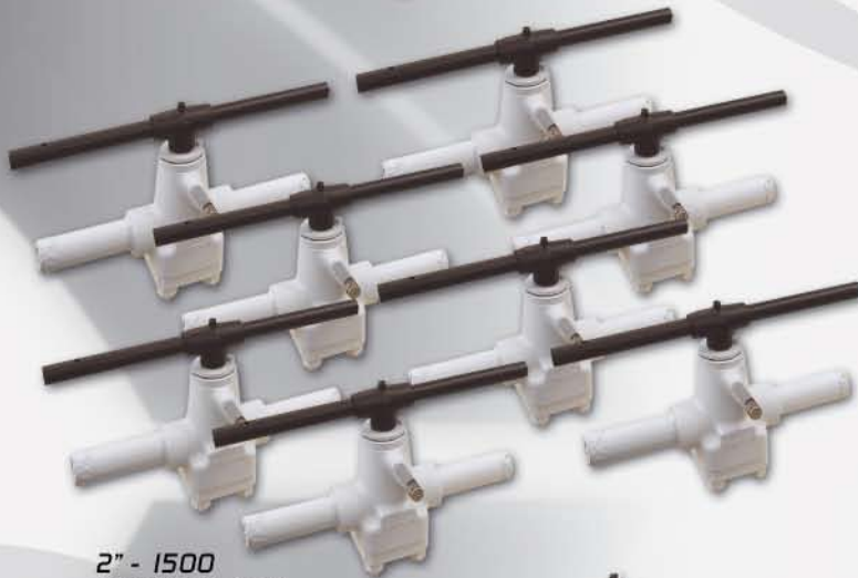
2" - 1500 Plug valve LF2