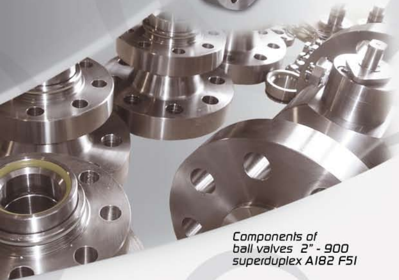
Components of ball valves 2" - 900 superduplex A182 F51