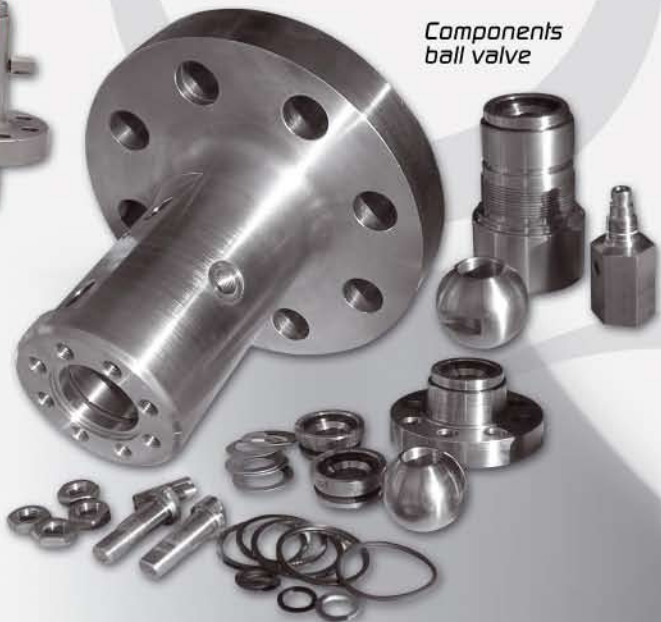
Components ball valve