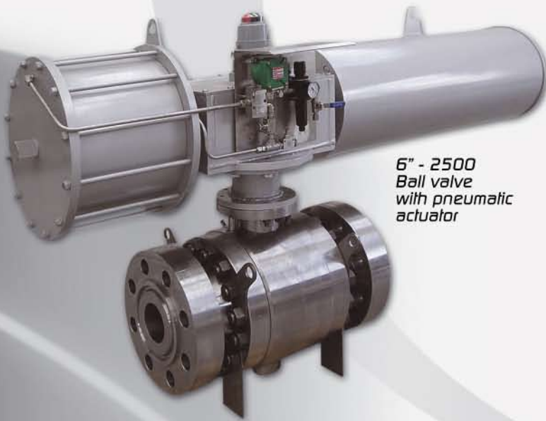
6" - 2500 Ball valve with pneumatic actuator

All valves can be fitted with a remote operated electric, pneumatic or hydraulic powered actuators. Energy Valves can assemble, set stops and functional tests prior to despatch.