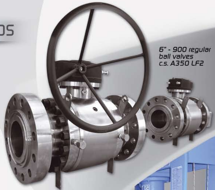
6" - 900 regular ball valves c.s. A350 LF2

All our valves are shipped with comprehensive material test certificates (MTC) according to 3.1 B, or other certificates, depending on client request.